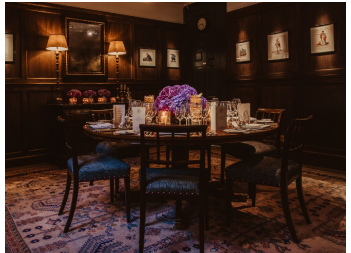
The Kingsman Room